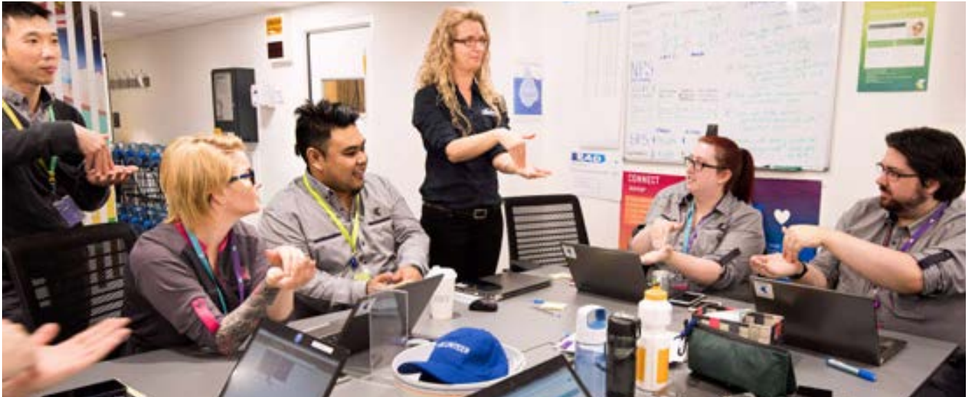
Melbourne Discovery Store staff in an Auslan training session

There's much more to discover than street-smart phones and chic wearables at Telstra's Melbourne Discovery Store. In fact, the 70 sales and support staff have become an in-vogue statement in themselves since they launched a deliberate push to mirror the diversity of Australia's most liveable city.