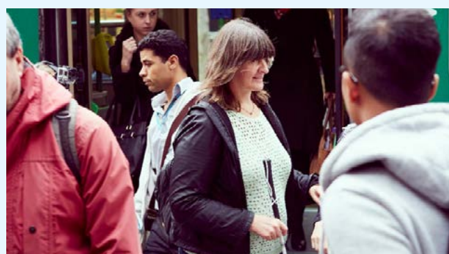
A blind woman stepping off a tram

Entrants will have access to mentors from the tech and innovation sectors and the disability community to help them develop and improve their concepts, so we can be sure that final submissions are a great fit for the affected community.