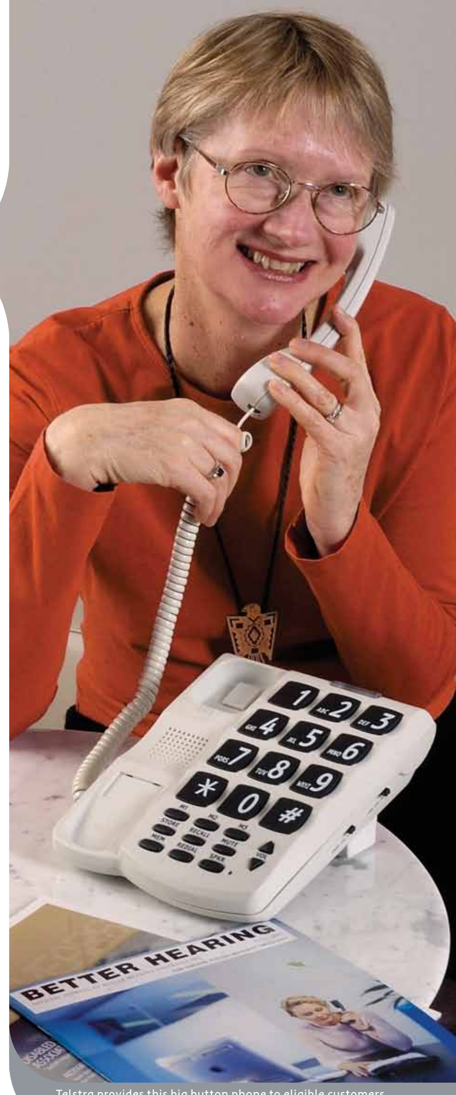
Telstra provides this big button phone to eligible customers through our Disability Equipment Program .