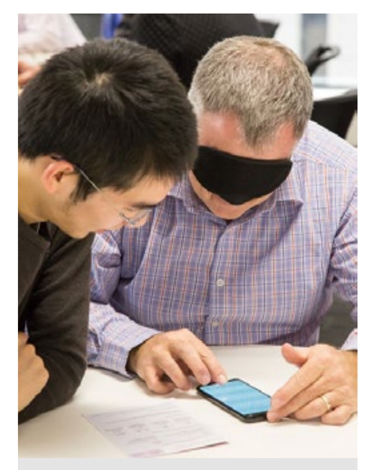
Trying to send a text whilst vision impaired

Participants were introduced to our checklist of non-negotiable accessibility requirements, as well as a number of tools for accessibility testing – including Vision Australia's <u>Colour Contrast</u> Analyser, the <u>Siteimprove Accessibility</u> Checker, and the <u>Funkify Simulator</u>, which provides a feeling of how the web can be experienced by people with different challenges.