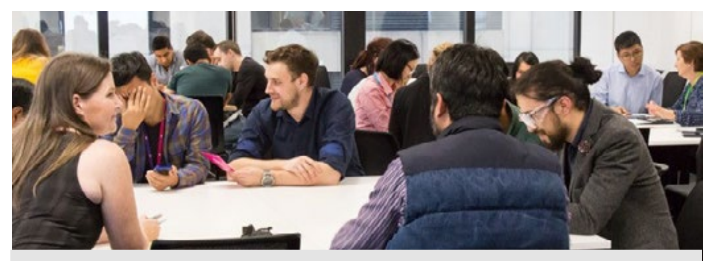
Participants at Telstra's first Digital Accessibility training

No one wants to imagine they're blind or have chronic arthritis or a learning disability, but that's exactly what the Accessibility & Inclusion team asked 130 Telstra employees to do last month, as it set about evicting them from their digital comfort zones.