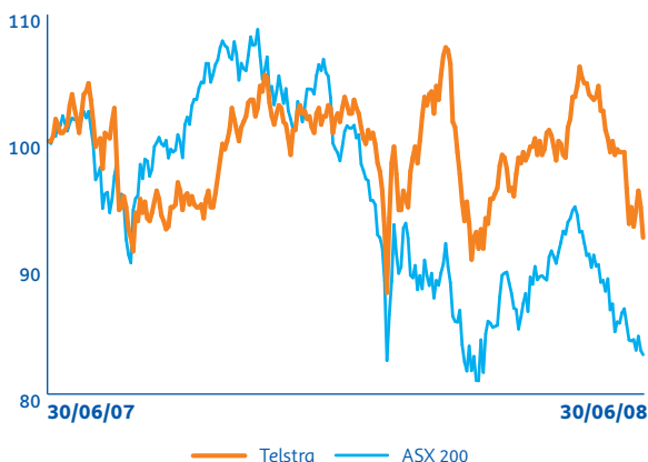
Telstra Share Price relative to the ASX 200