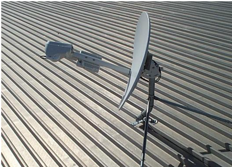
Product or Service Image