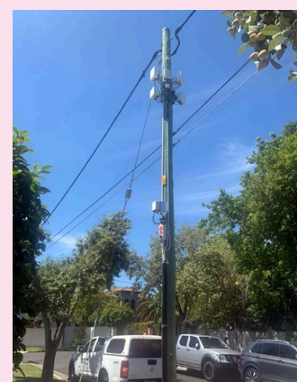
Example 5G mmWave small cell